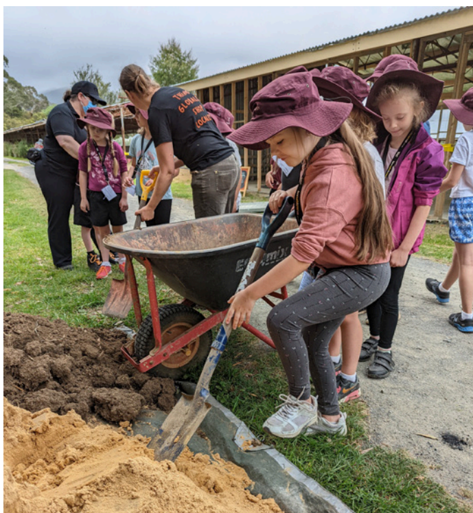
Sustainable Building - making earth render