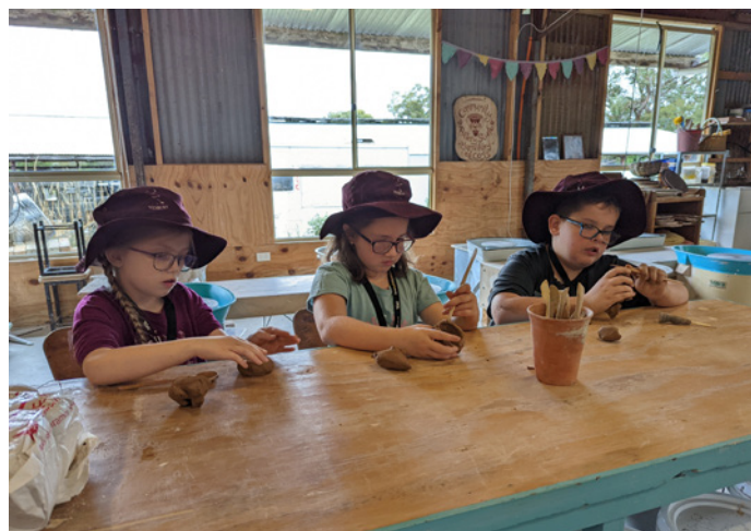
Clay Play with Wesburn Primary