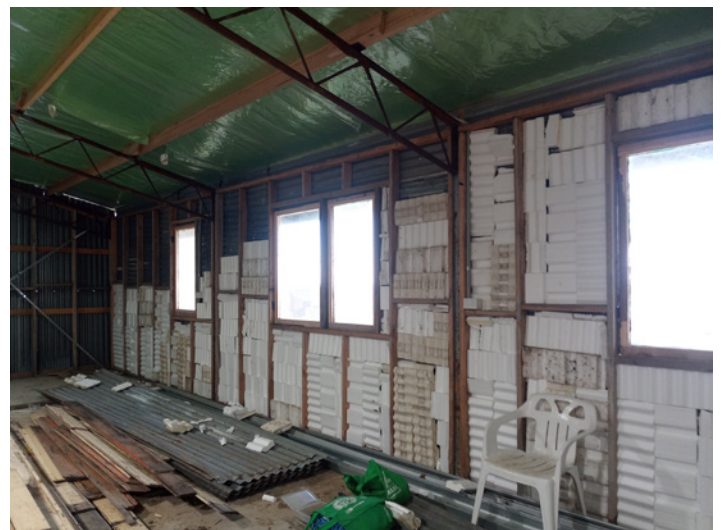
Recycled wall insulation

Wesburn Primary school students helped to collect plastic bottles full of soft plastics and placed them into a wall for insulation. The rest of the insulation was salvaged polystyrene from a building site.