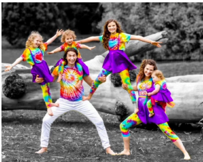
The Dreaming Space

The Dreaming Space offers a space for the community to step into their potential through creativity. We hold classes for circus, dance, aerial acrobatics and magic. We also offer space for Women's groups, Poetry exploration nights, Chanting and tai chi. We assist at Festivals with space for library shows and offer Dreaming Space artists, performances and free play.