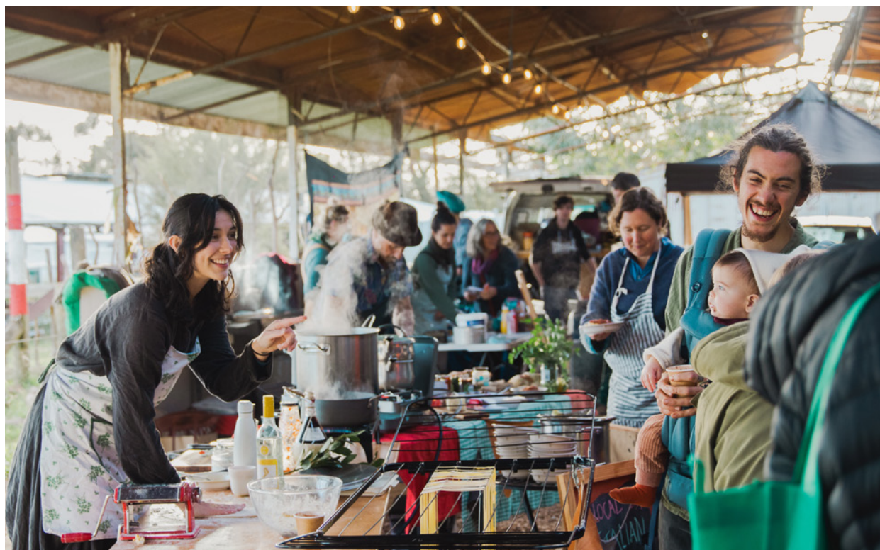
Front Cover Photo: ECOSS 'LIVING' Installation Above Photo: Italian 'Taste of Culture'