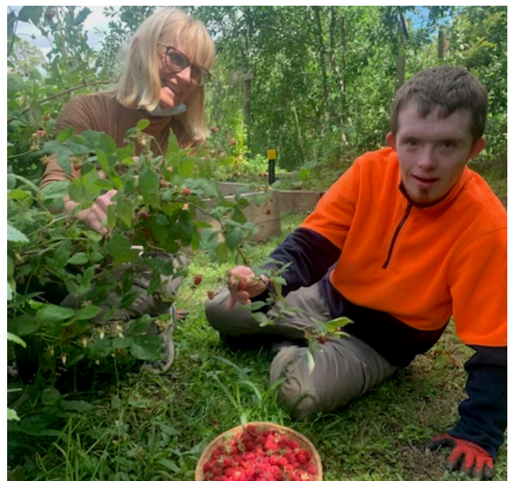
Harvesting raspberries in the ECOSS Community Garden

I would also like to acknowledge our Crops for Community grant providers: Yarra Ranges Council, FRRR, ANZ, NAB. And a big thanks to all our volunteers for their hard work and dedication.