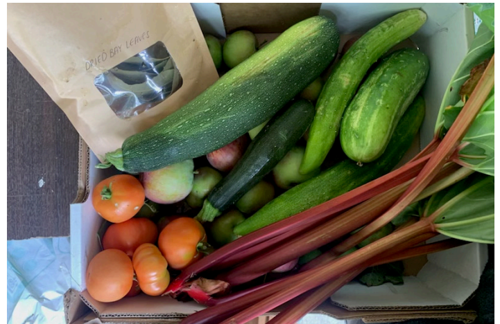
Crops for Community Veggie Box

We established a Facebook group specifically for volunteers and their families where we share photos and stay up-to-date on the progress of the garden and site happenings.