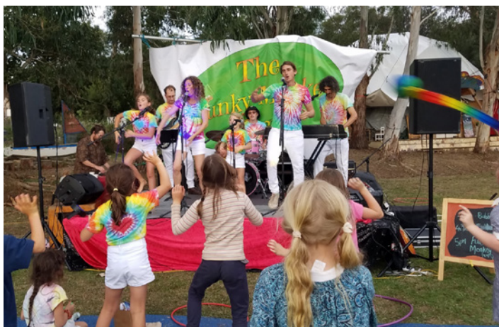
The Funky Monkeys

April was Nature Play Week - with The Funky Monkeys performing for us on the Village Green!