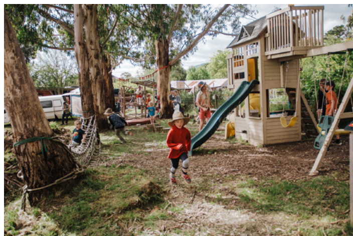
ECOSS Twilight Market