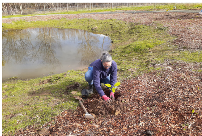
Beginning planting for the Food Forest