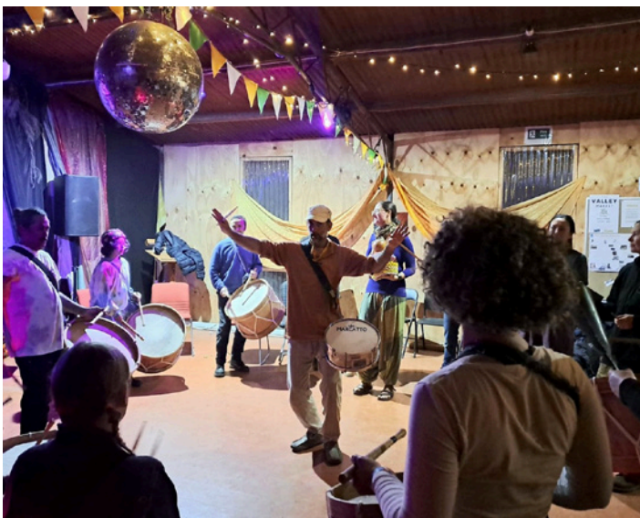
Brazilian Percussion Workshop