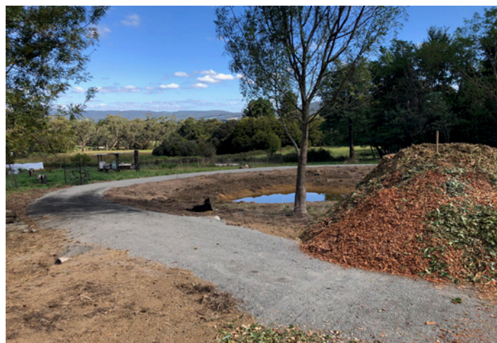
Site preparation for the Food Forest

Over the next 2 years the Food Forest remained as just a possible idea but some planning was still happening behind the scenes. In 2022 there was enough impetus to take the first real steps.