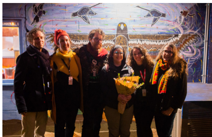
The Creation Story Mural Team

RMIT Industrial Design Students for Creating the Soundscape box and technical support.