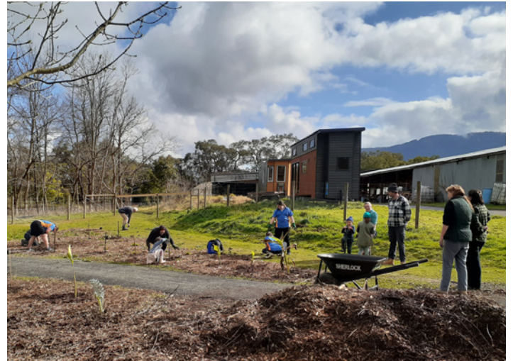
Permaculture Yarra Valley Working Bee