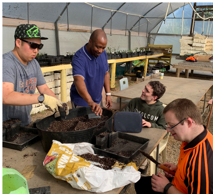
Potting Up for Seed Raising