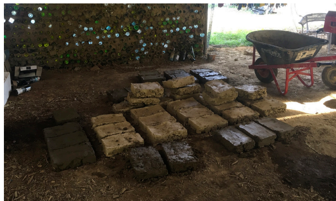
Mud Brick Building

- Cire Services: The Cire Services Community School came weekly throughout the year 2019 and for the first Term of 2020. The students worked on a number of ongoing projects around ECOSS including earth building of the earth seat and the bottle room. They learnt about various types of earth building including recycled bottle walls, earth rendering and mud bricks. They also worked on the new pizza oven in the Coop and the Upcycled Playground.