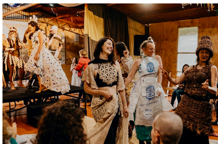
Recycled Fashion Parade

This event was created to raise awareness around the Fashion industries environmental footprint - one cotton shirt uses about 2,700L of water and then there is transportation, waste & carbon. Non-organic cotton uses 23% of the world's insecticides and 10% of all pesticides.