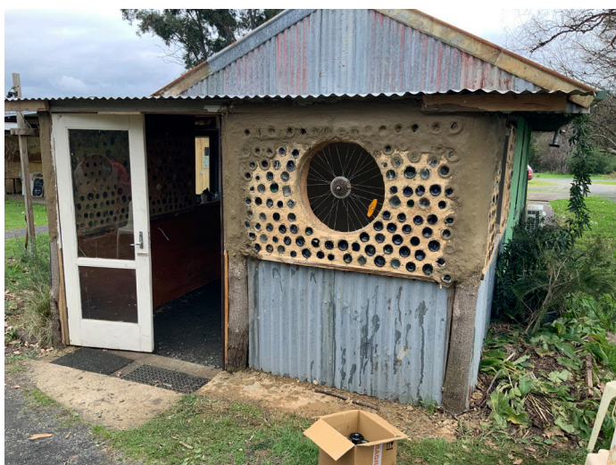
Bottle Wall Room

The Melbourne Adventure Hub brought out a large group of students from Melbourne as part of their Outdoor Education Camp. The students spent 4 days at ECOSS working on various projects including earth building and bush regeneration.