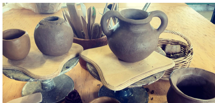
Community Pottery Studio

The Pottery Studio has been gently and slowly unfurling with the pause of the lockdowns. Weekly facilitated open studio spaces and classes are a warm and sheltering place for folk to continue their individual practices of working with clay, some handbuilding and others on the pottery wheel. We are so grateful to share this space with so many good folk and hope to continue in this way. We are dreaming of some improvements to the space, and hoping to bring those changes into being soon. Blessed to share in the beautiful unfolding of the Ecos family.