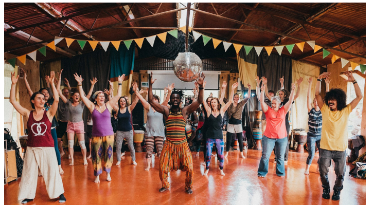
West African Dance Workshop

Thank you to Bendigo Bank - Warburton & Yarra Junction branches and Yarra Ranges Council for supporting this project.