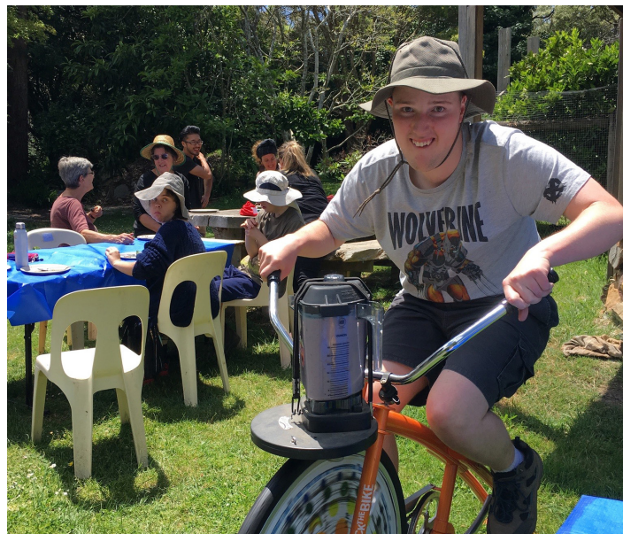
The Smoothy Cycle

-Increased access to Organic harvested food.