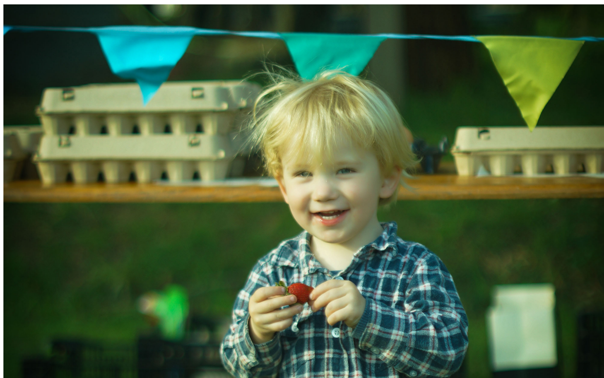
Front Cover Photo: West African Immersion Above Photo: The Valley Market ECOSS