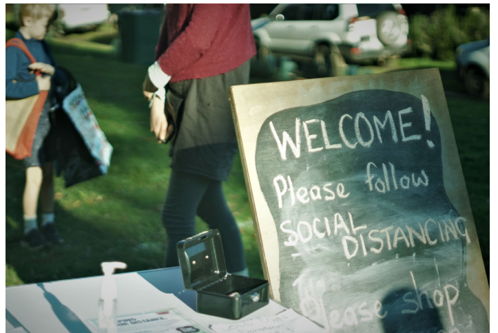
The Valley Market ECOSS

The Rare and Heritage Fruit Tree Grafting Day