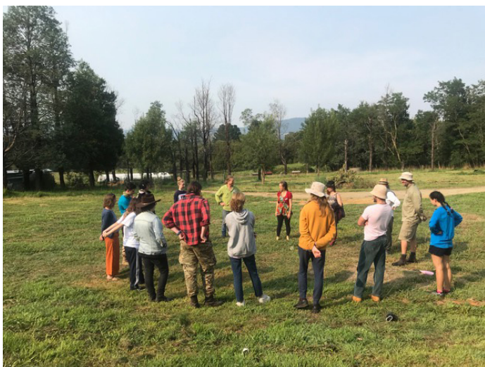
Sofia Mundi Steiner School students

ECOSS was fortunate to receive a Yarra Ranges Council Grant to support groups to come and participate in a Practical Earth Education Program. This will financially support groups to visit ECOSS with a discount on their excursion.