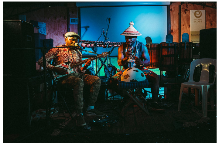
West African Immersion 2019

Thank you to The Victorian State Government-MultiCultural Commission for funding this event.