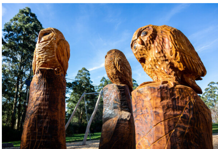
Owls by Bushwood Creations

'EcoSS has been so welcoming and perfect for me since I moved in. I have a better space than I could have imagined and I am so grateful to be part of the lovely community. Best move ever!'