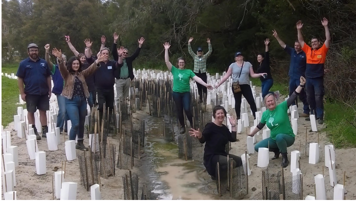
Landcare for Singles

Landcare for Singles Event by Intrepid 29/9 This event was a collaboration between ECOSS and Landcare, with a focus on revegetating the BioFiltration swales running near the polytunnels into the dam. It was also a romantic opportunity for the planters to find a new love.